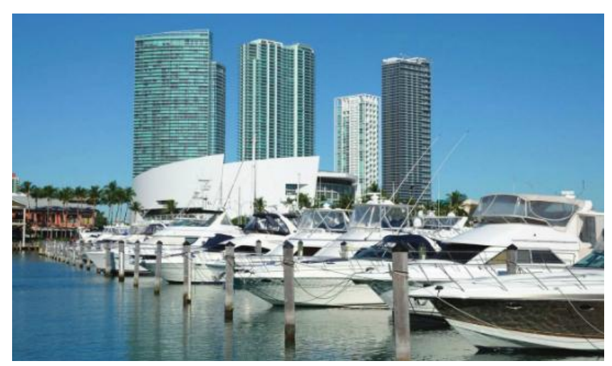
The ever-evolving cityscape of the Brickell/Downtown area has a lot of locals excited about all of the possibilities the future holds.