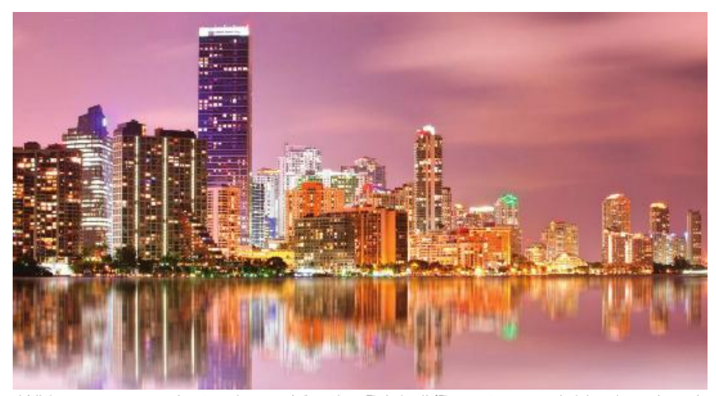
With so many projects planned for the Brickell/Downtown neighborhood and its adjacent enclaves, it's no wonder the area is surging in popularity both locally and around the world.