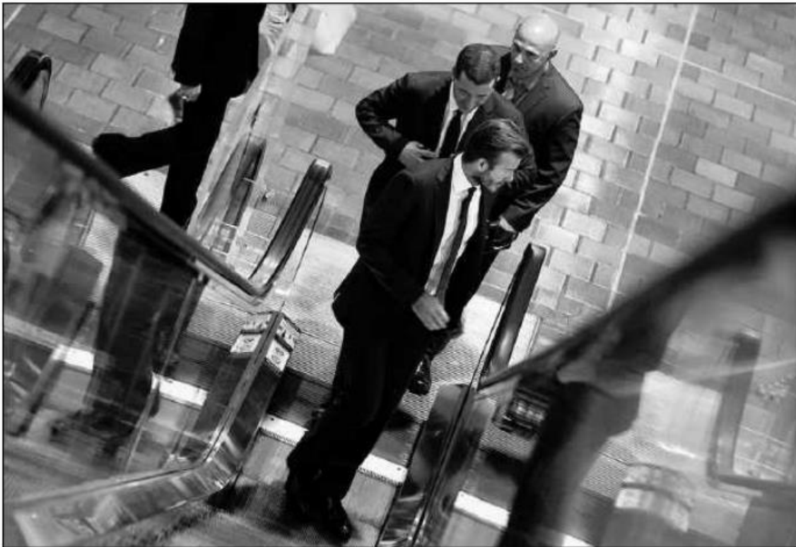
PUSHING HIS CAUSE: David Beckham arrives at the County Hall to talk to the county commission regarding the soccer stadium site May 7.

would also like to be reimbursed for the nearly $12 million it has spent upgrading the slip, according to the mayor.